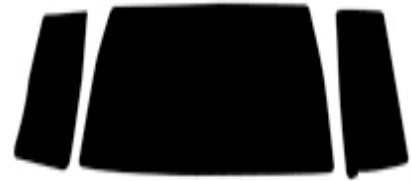
Rear Cab Kit