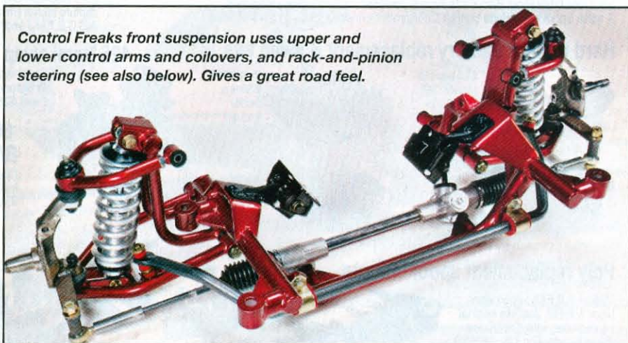
Control Freaks front suspension uses upper and lower control arms and coilovers, and rack-and-pinion steering (see also below). Gives a great road feel.

Working with a company that water blasts bridges and huge water tanks, Blue Moon had them develop special heads that at a fine