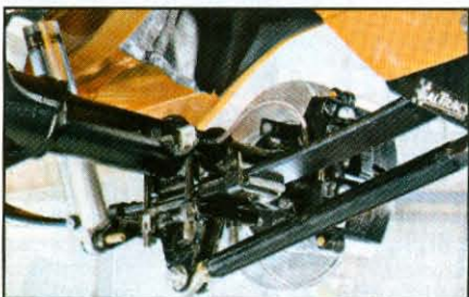
CalTracs rear suspension features adjustable preload with split monoleaf and traction bars. Note added section in middle of wheelwell.

taking the '68 Dart out of the '68 Dart. Some of the other clones, like the Motion Super Camaro, with its wide fenders are more caricatures than faithful repros. And, they cost thousands more than the Mr. Norm's Dart, which is the real deal. As was true with the original, the new Dart places emphasis on unreal acceleration.