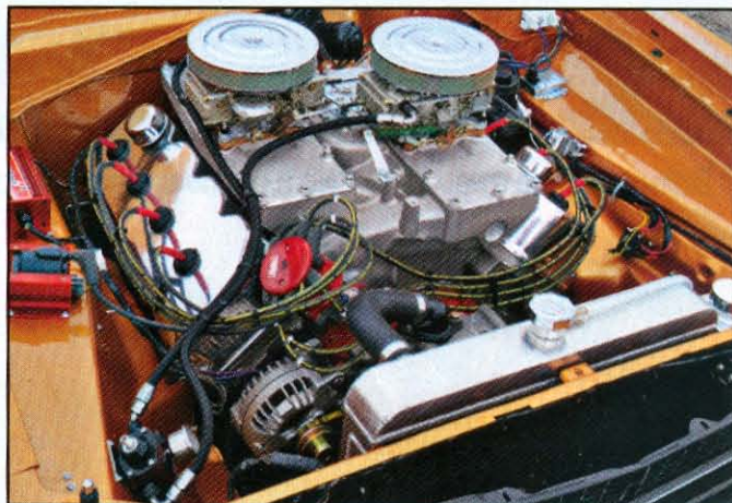
528-inch stroker Hemi pumped out a dyno'd 727 HP. Mill uses MP Megablock and Indy Legend Hemi heads. An all-aluminum street bullet is said to be in the works.