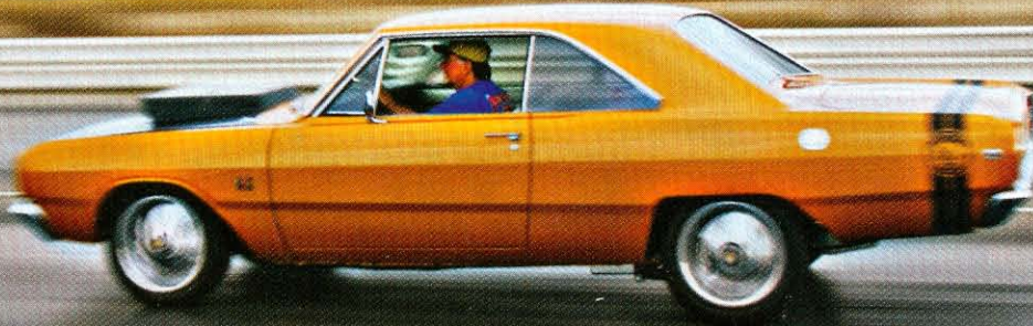
Dart turned 11.0 at an altitude of 4500 ft. At sea level, and with some suspension adjustments, look for 10.75-10.80s.

PALMDALE Custom Paint & Body Specialists Classic or Collision 947-6187 sierrautobody.com